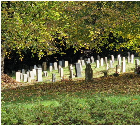
All Saints Burial Ground