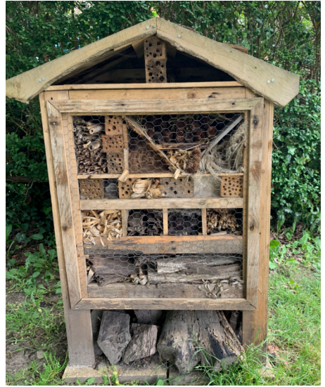
Example Insect Hotel in Ashurst Wood made by The Shed

The roof will also hold its own, as it will be a 'living roof'. This is planted with a variety of sedum seedlings – tiny to start with but which will gradually spread and provide a green, living cover for the Hotel, as well as flowering and giving a pretty, nectar rich display.