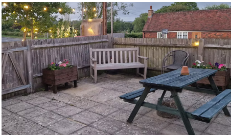
Danehill Social Club Courtyard

Our popular food trucks continue to bring delicious flavours to the village