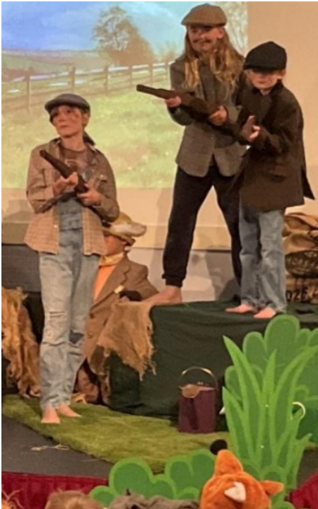
Boggis, Bunce and Bean ready to hunt down Mr Fox!